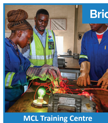
MCL Training Centre

MCL, has since 2015, been greatly contributing to empowering local youth to gain employment in various industries by teaching them vocational skills and reducing the skills gap of the community. This venture is through the Maamba Collieries Training Centre (MCTC), which runs TEVETA certified Trade 2 certificate level courses for young women and men in Metal Fabrication & Welding and Electrical Technology. Over the past 8 years, MCTC has helped around 238 youth acquire relevant skills and find employment with their newfound skills.