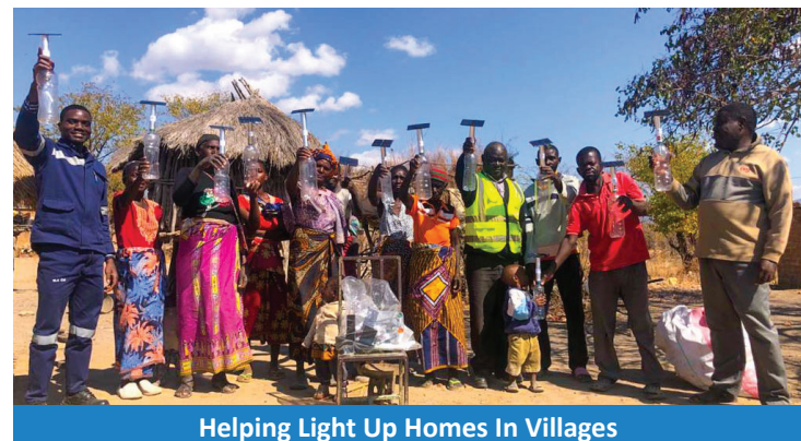
Helping Light Up Homes In Villages

In the spirit of community development, MCL continues to strive to help uplift the lives of the people of Maamba and surrounding areas, in this case by making the district a brighter and better place.