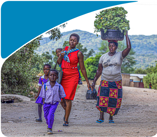
MAAMBA TOWNSHIP ROADS .....BEFORE Unattended for 4 decades