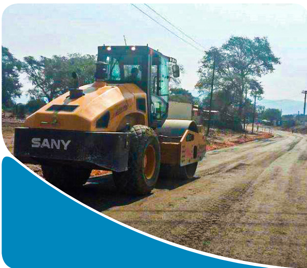
WORK IN PROGRESS In-house construction using consultant design