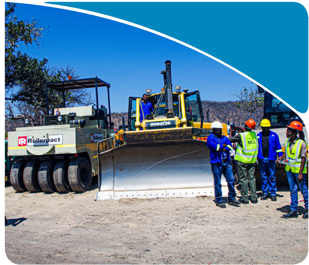
FLAGSHIP PROGRAMME Purchase of special road building equipment