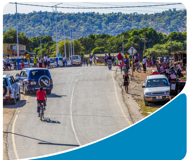
MAAMBA TOWNSHIP ROADS... NOW Pride & joy of the community