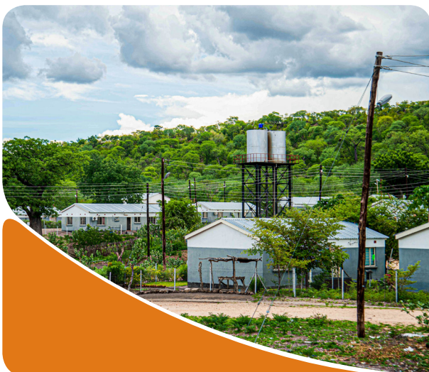
RESETTLEMENT VILLAGE Newly constructed with modern facilities