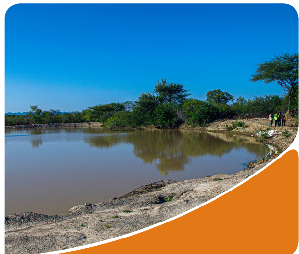
SINANKUMBI DAM Lifeline for 15 plus villages and hundreds of families