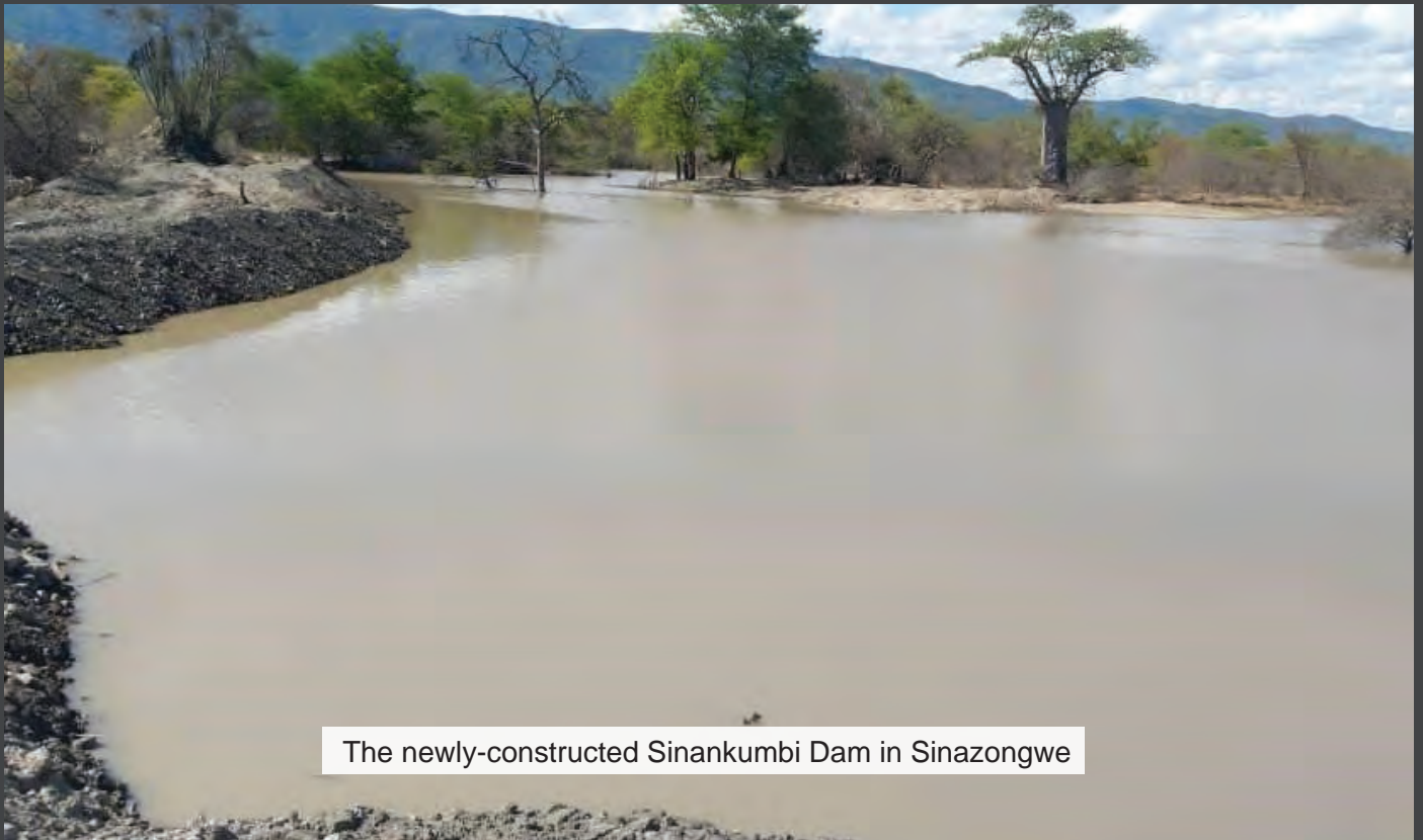
The newly-constructed Sinankumbi Dam in Sinazongwe

M CL last year completed construction of a dam in the remote region of Sinankumbi in Sinazongwe District. Sinankumbi is one of the hottest and driest areas in Zambia, and the dam is crucial for the indigenous people, as it will help alleviate their problems of acute water shortages, hitherto negatively affecting human and animal life.