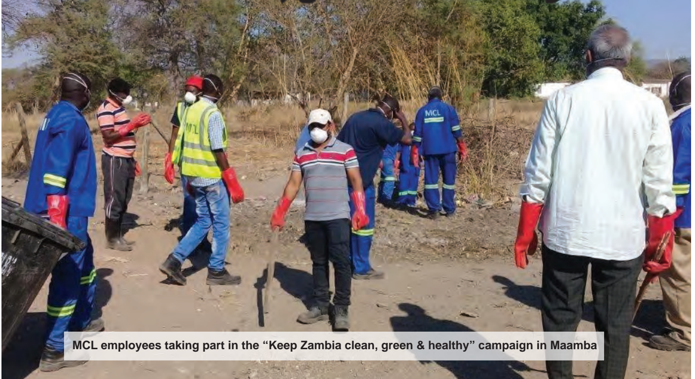
MCL employees taking part in the “Keep Zambia clean, green & healthy” campaign in Maamba

A part from the ongoing ‘Green Maamba’ initiative, MCL is soon to start distributing saplings to individual households in Maamba as part of the national programme to support the “Keep Zambia clean, green and healthy” campaign among community members.