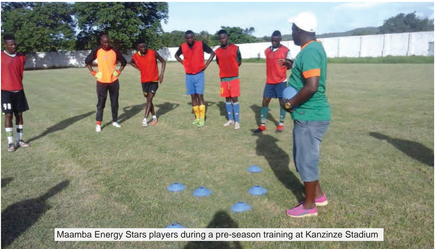
Maamba Energy Stars players during a pre-season training at Kanzinze Stadium

M CL-sponsored Maamba Energy Stars Football Club performed extremely well last season, after winning a promotion to the Division One following an excellent showing in the 2017 football season.