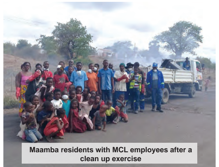
Maamba residents with MCL employees after a clean up exercise

Towards this overall aim, MCL in 2017 had donated a 30-Ton Tipper Truck and a Back Hoe loader; worth Kwacha 1.2 million to Sinazongwe District Council for solid waste management in the area and supplemented this in 2018, by donating refuse collection bins for solid refuse collection.