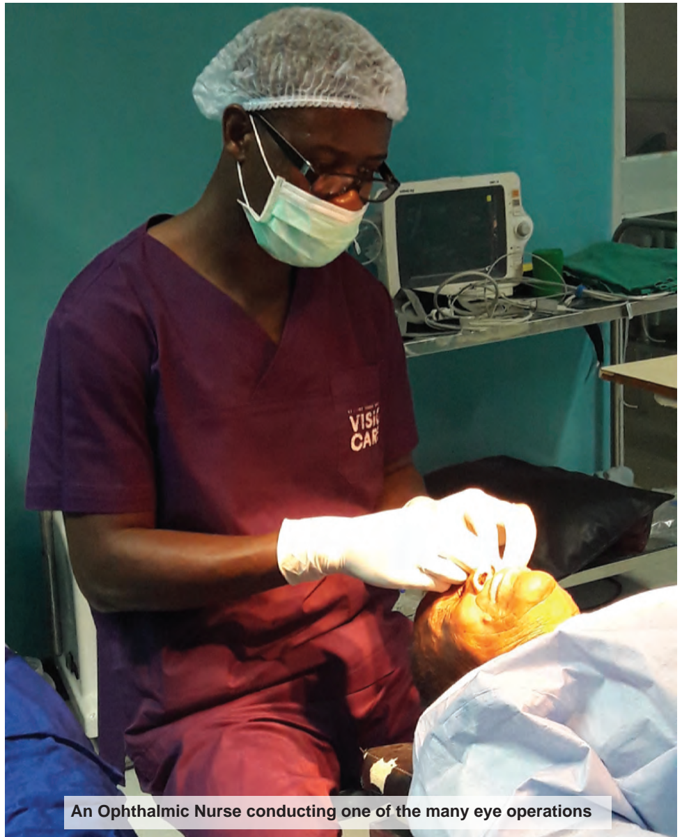
An Ophthalmic Nurse conducting one of the many eye operations

To overcome this medical problem and social issue, and to alleviate the shortage of optometry professionals and other eye health practitioners in the country, MCL in October 2018 sponsored the second screening and surgical camps in 10 different locations in Sinazongwe District including less accessible and more remote regions.