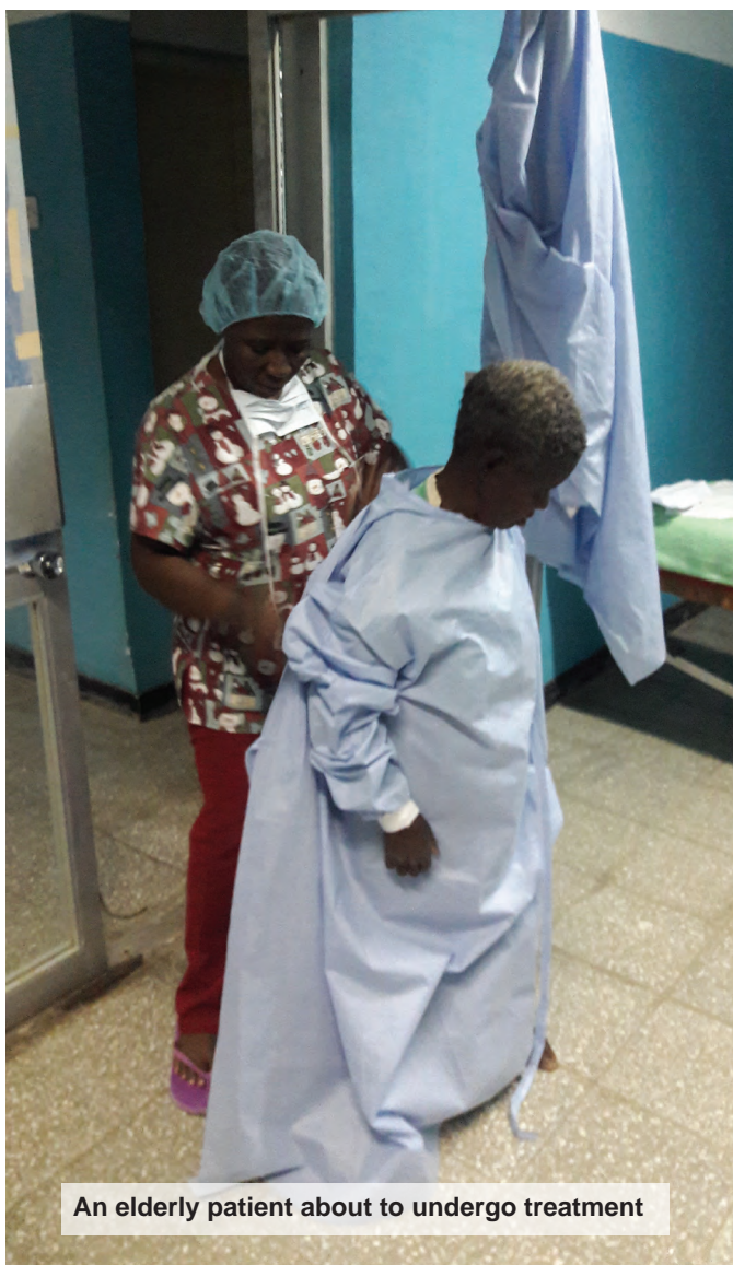
An elderly patient about to undergo treatment