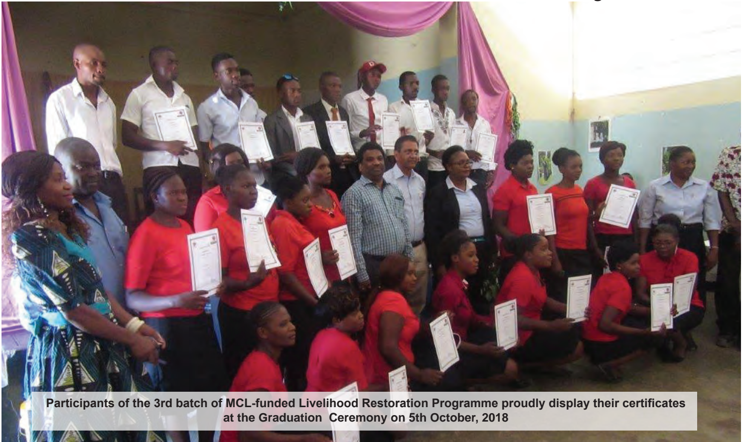
Participants of the 3rd batch of MCL-funded Livelihood Restoration Programme proudly display their certificates at the Graduation Ceremony on 5th October, 2018