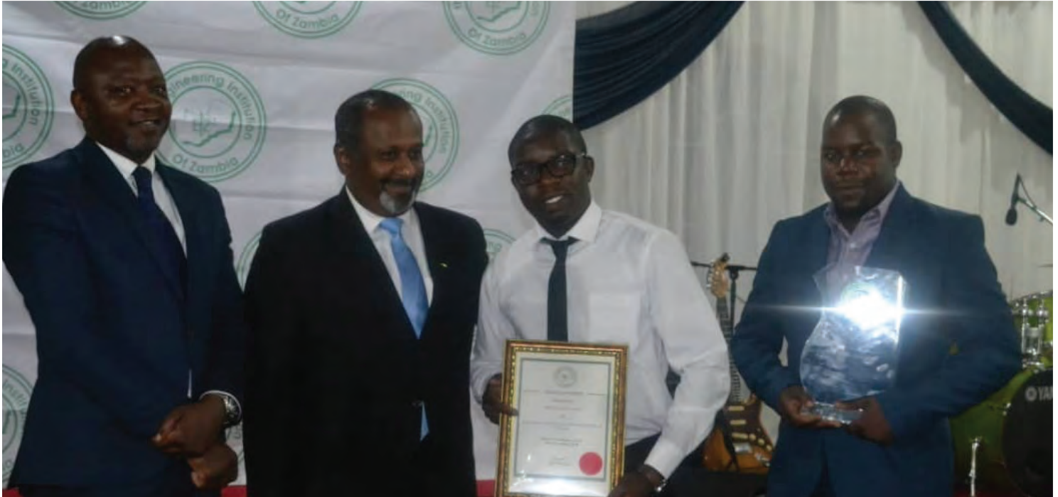
MCL receiving an award for “Outstanding Contribution to Solving Problems of Society” during the EIZ - 2018 Engineering Excellence Awards in Lusaka