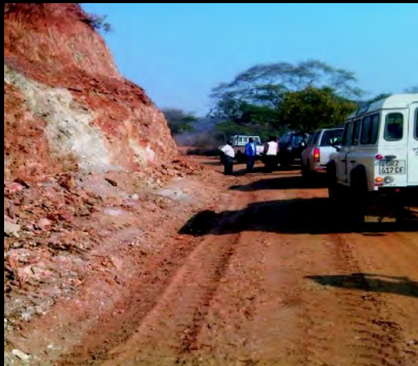
Top: Maamba Masuku Road Construction