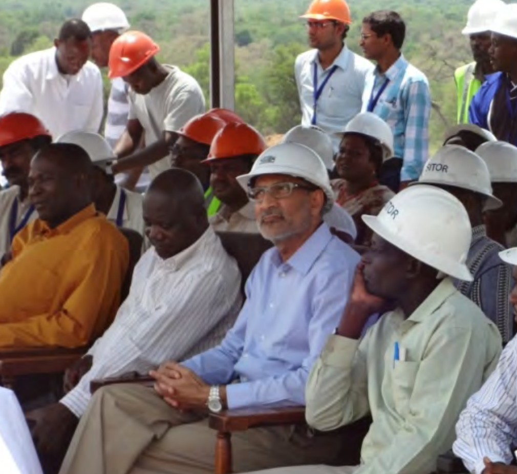
MCL has brought hope for development to Maamba Town

A massive purge of retrenchments followed in 1997 which did not make the company any better. MCL had accrued many liabilities and abrogated on many statutory obligations, hence so many litigations in the courts of Law. Zambia's only coal mine was simply unmanageable despite changing many Chief Executive Officers.