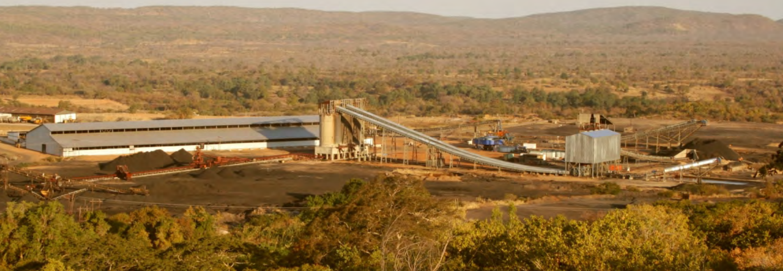
A view of the mine from the mountain