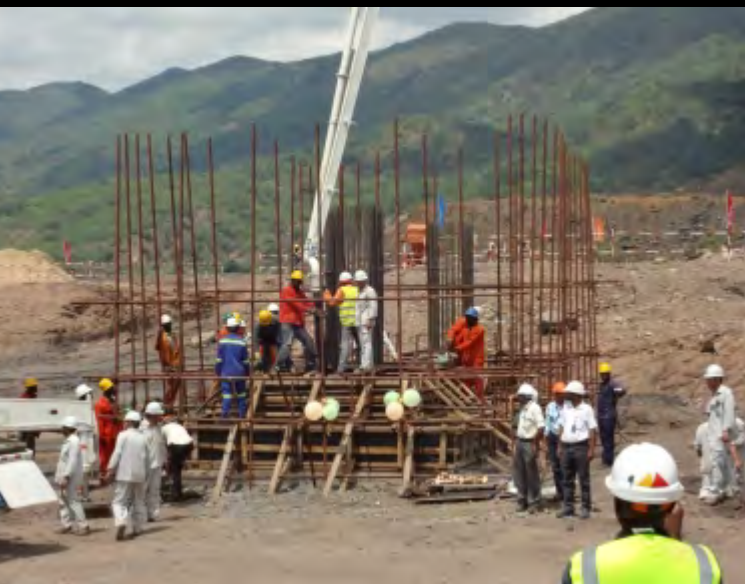
Top: Construction at Maamba underway