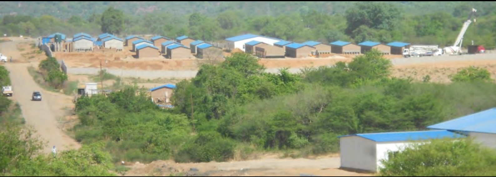
Top: The SEPCO Camp. SEPCO is the Construction company developing the Maamba Powerplant