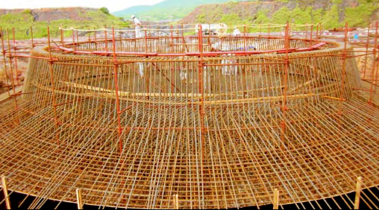
Construction for the New Thermal Power Plant Chimney