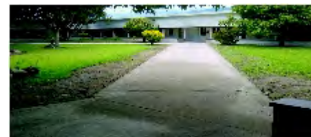
Top to bottom: Inside Trainee Hostel and refurbished MCL Head Office